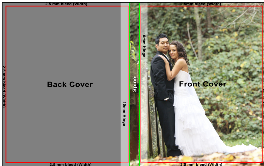
Photo Hard Cover