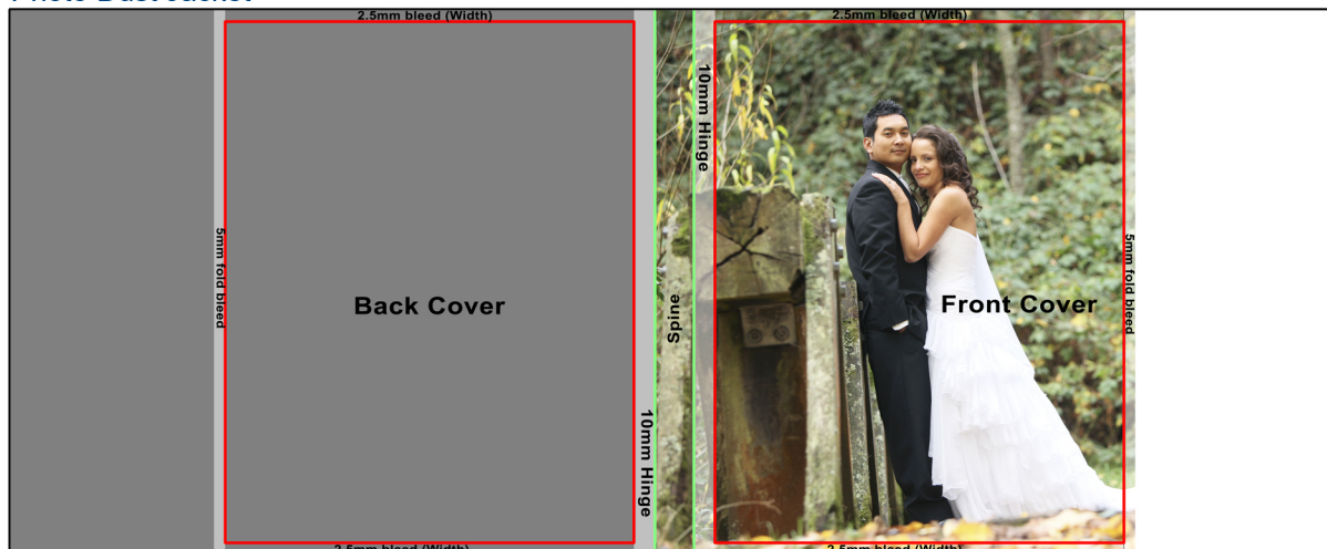
Photo Dust Jacket